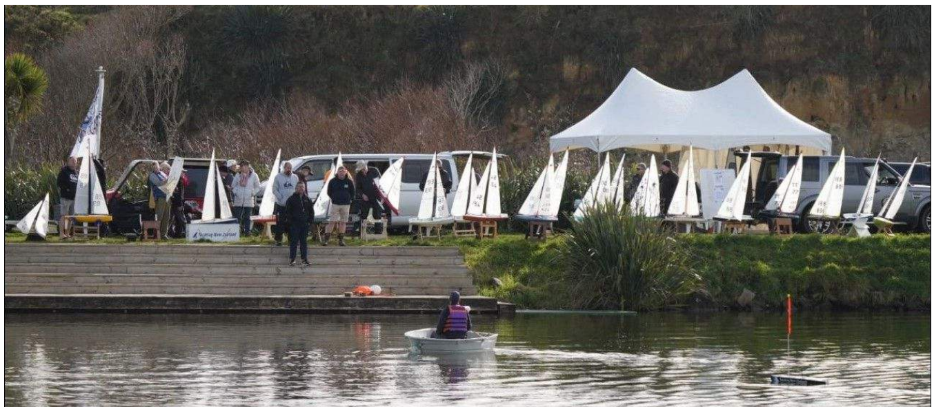
20230812 New Plymouth Photo .jpg