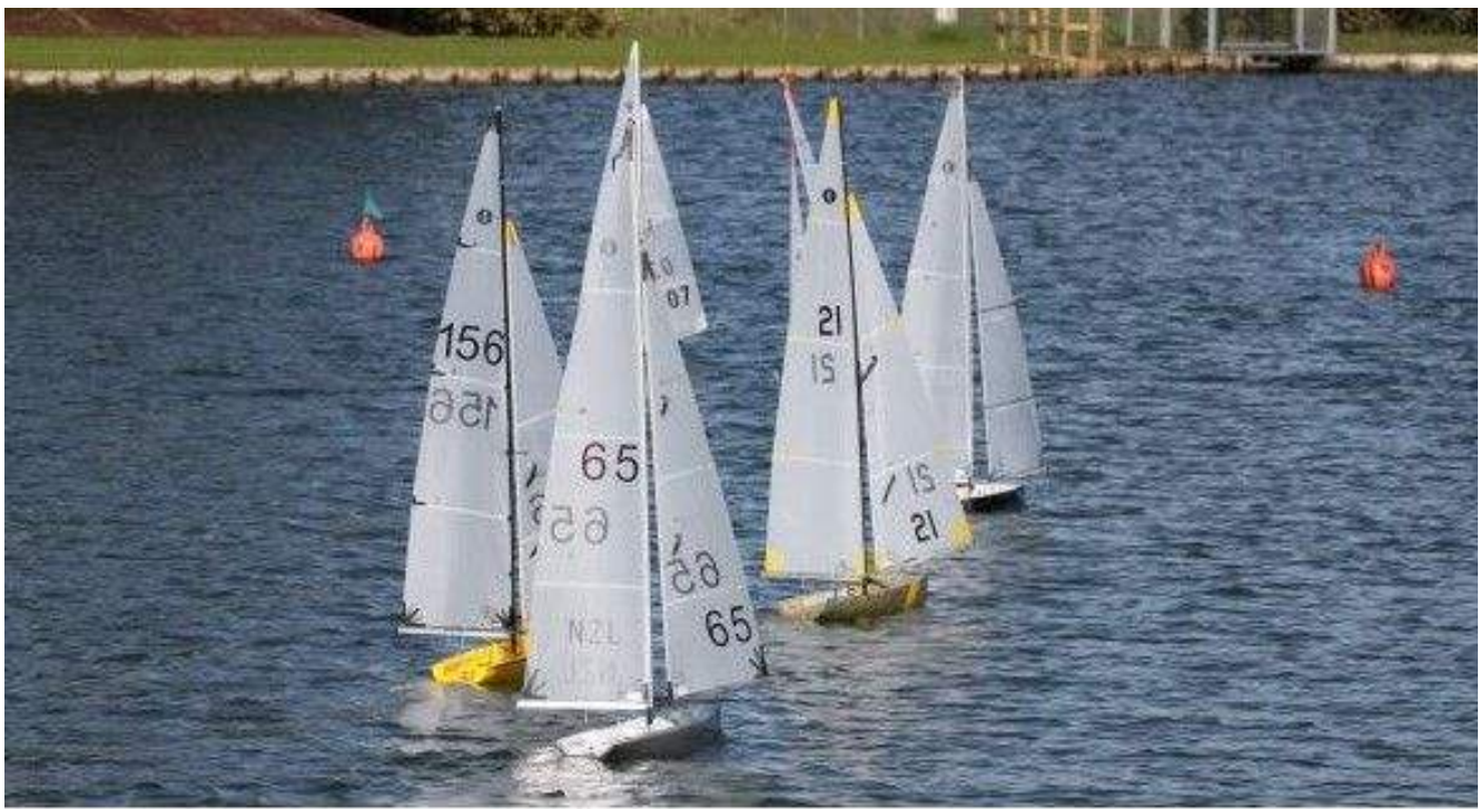
20200619 Fatboys at Wattle Photo.jpg