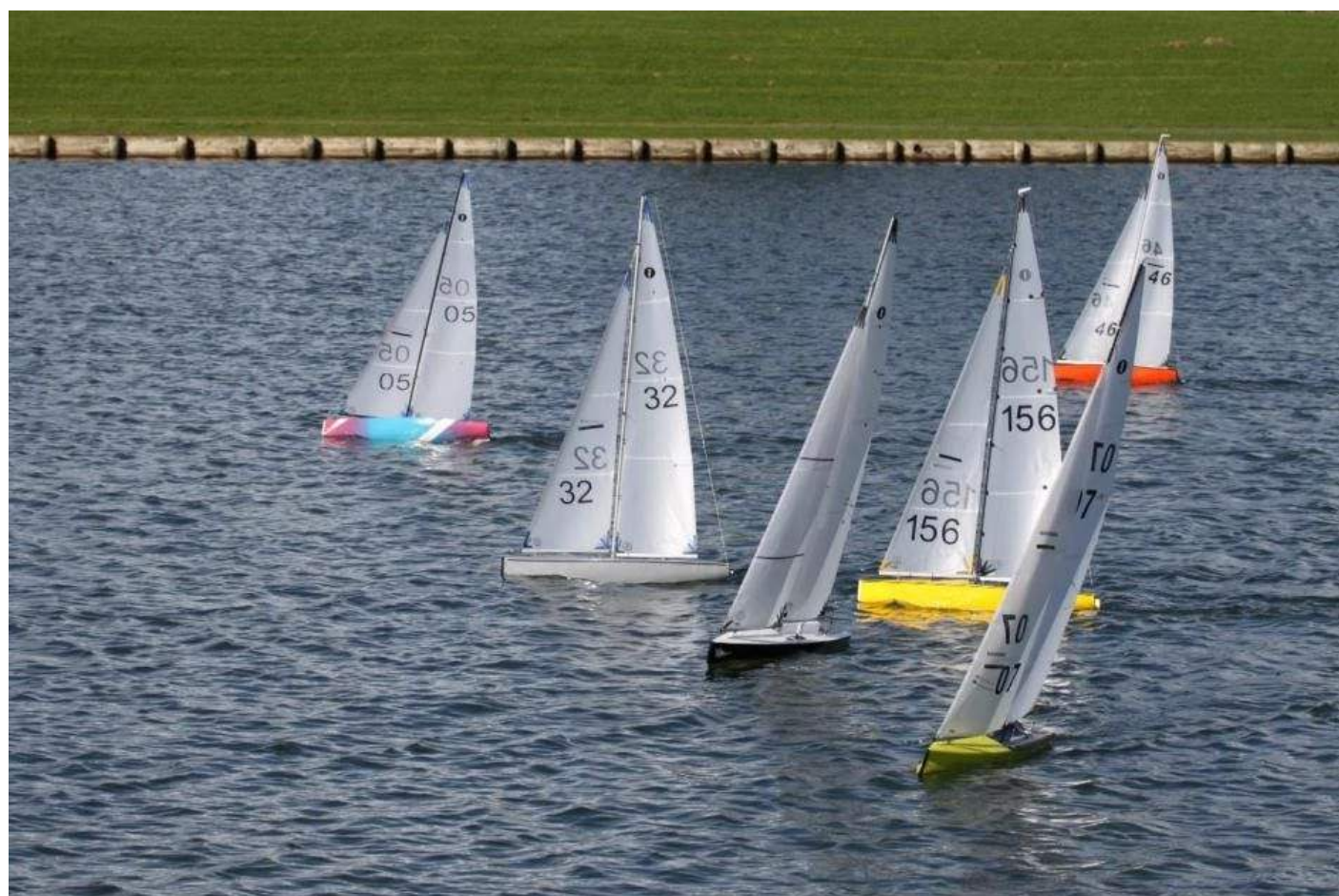
20200805 Fat Boys Wanted Photo.jpg