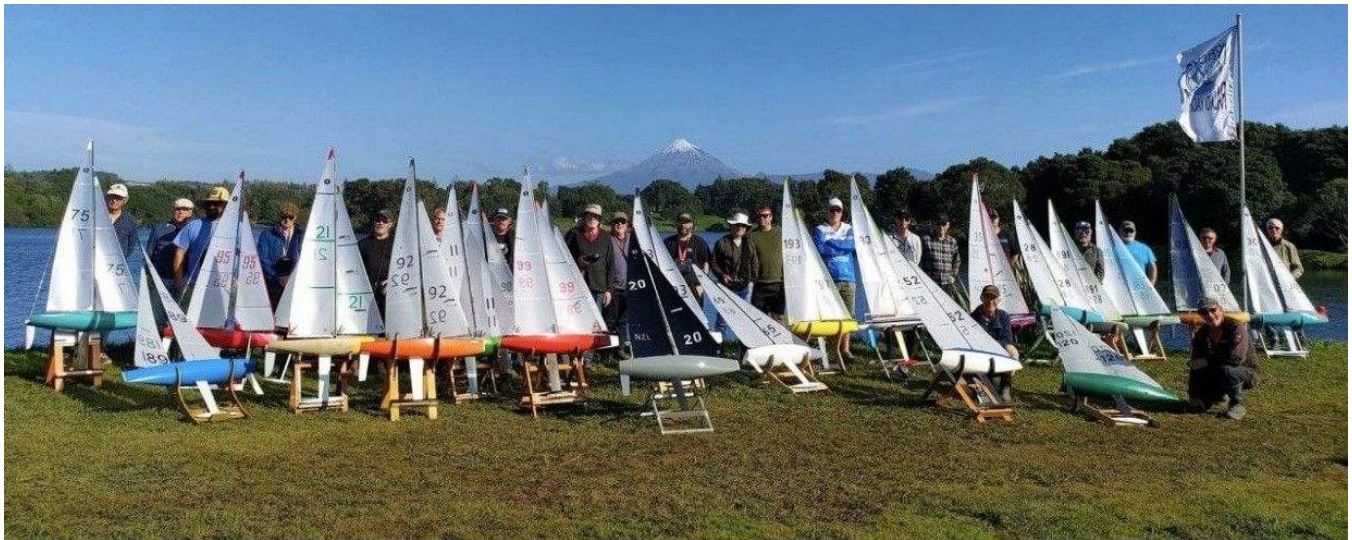
20240901 New Plymouth Photo.jpg

If you have a classic IOM sitting in the shed dust it off and come and enjoy some great sailing. The next classic regatta is later this month hosted by the Kapiti Radio Yacht Club Inc find details 📌