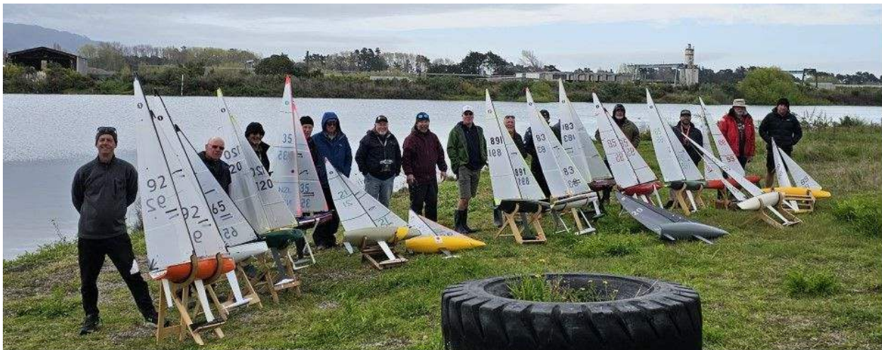
20240921 Kapiti Photo.jpg