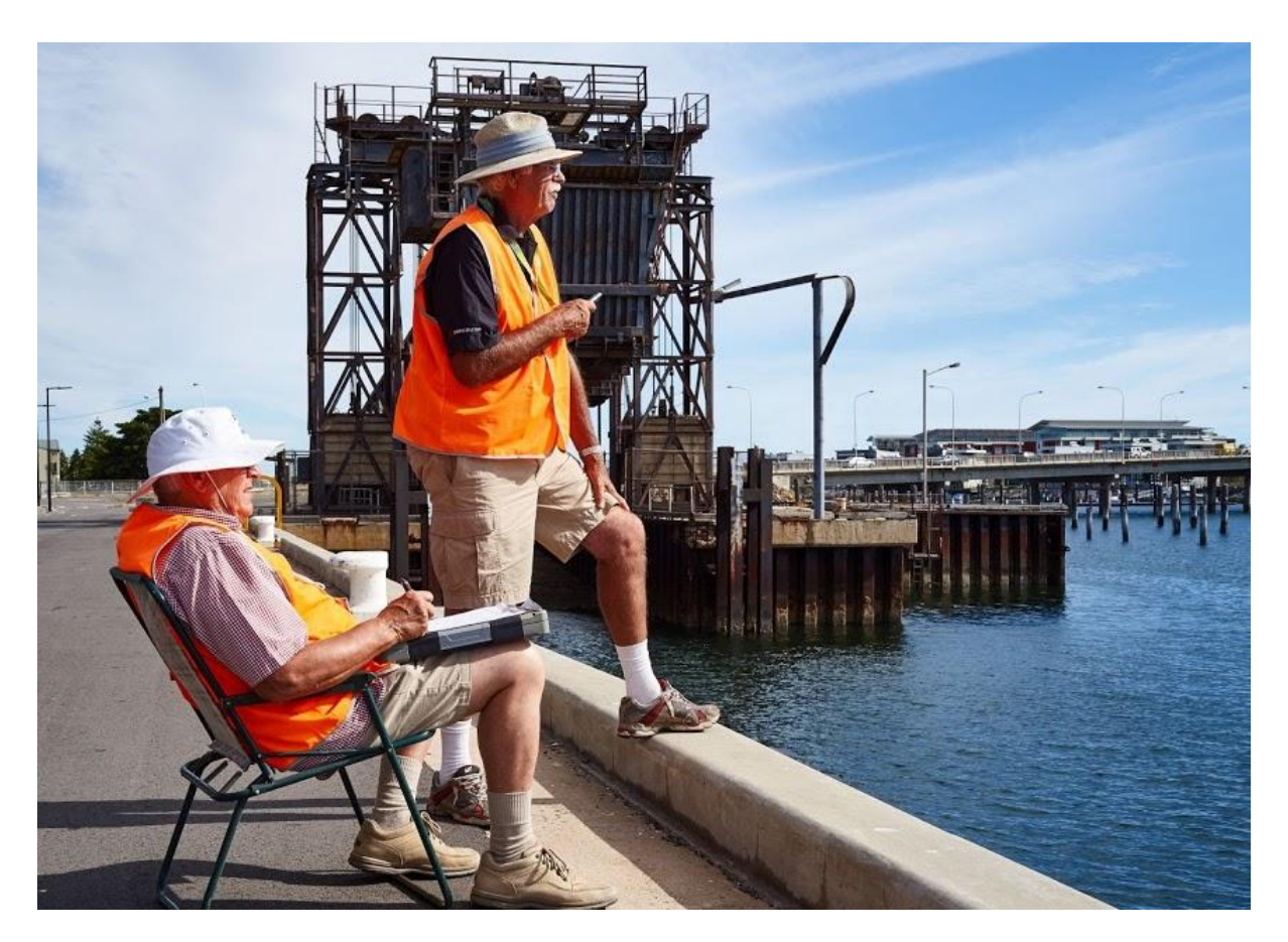
Checking which boats are on the water

For the purposes of scoring, it is necessary to know which boats are 'sailing in the vicinity of the start'. In conjunction with your scorer or recorder, go through the list of competitors scheduled to race in the heat, and make note of who is present on the water.